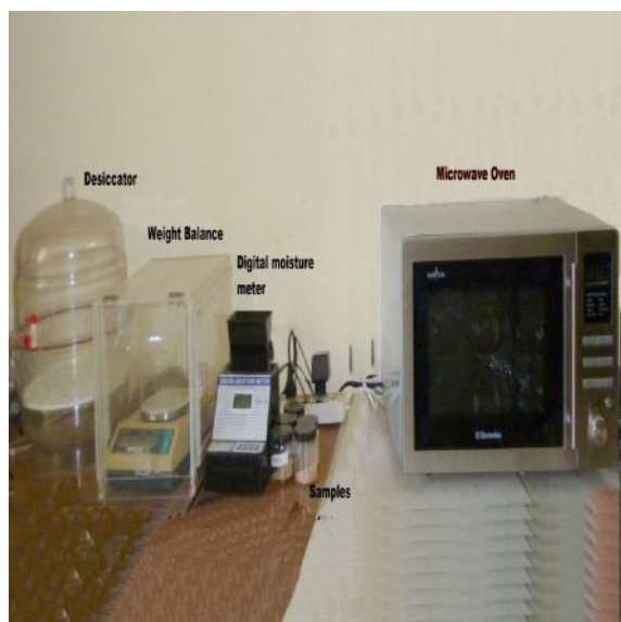
Figure 1: Pictorial View of Whole Moisture Analysis System (Including Standard Moisture Meter and Microwave Oven Based Technique)

Note: Figure 3 Trend curve of % moisture of Red lentil (masor dal) w.r.t. time for standard moisture meter data and microwave oven heat treatment analysis data.