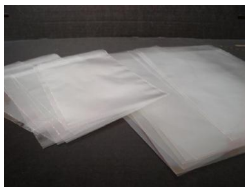
Figure 3: Packaging Material Used

Polypropylene (PP) was used as the packaging material for packing Nutri Foodles. PP known as polypropene, is one of