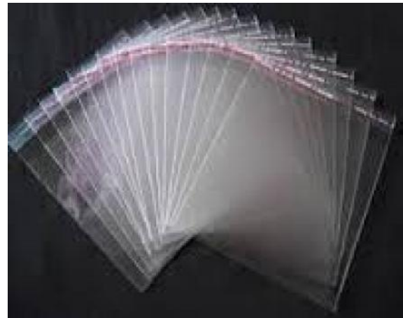
Figure 2: Bopp

It is an important marketing tool for the product. And informs the costumer the details of nutrients which he can have or not accordingly. Label consists of ingredients of the product, nutritional facts, whether veg or non-veg, price, manufacturing date, expiry date, net weight, any special recommendations, etc. It should also be eye catching and attractive to improve sales.