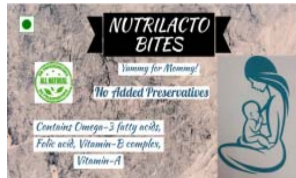
Figure 4: Back Side of Nutrition Label