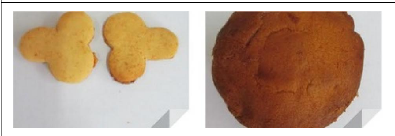
Figure 1: A) Biscuit and B) Rice Cake

The purpose of this study was to explore the possibility that a standardized dose of biscuits or rice cake can be an effective and well-tolerated alternative to the 75-g glucose beverage for the screening of women for gestational diabetes. In this study what we found was it can be effectively used in the rice cake model. Boyd et al. (1995)